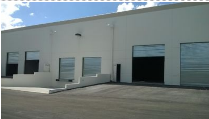
Madison Truck Court